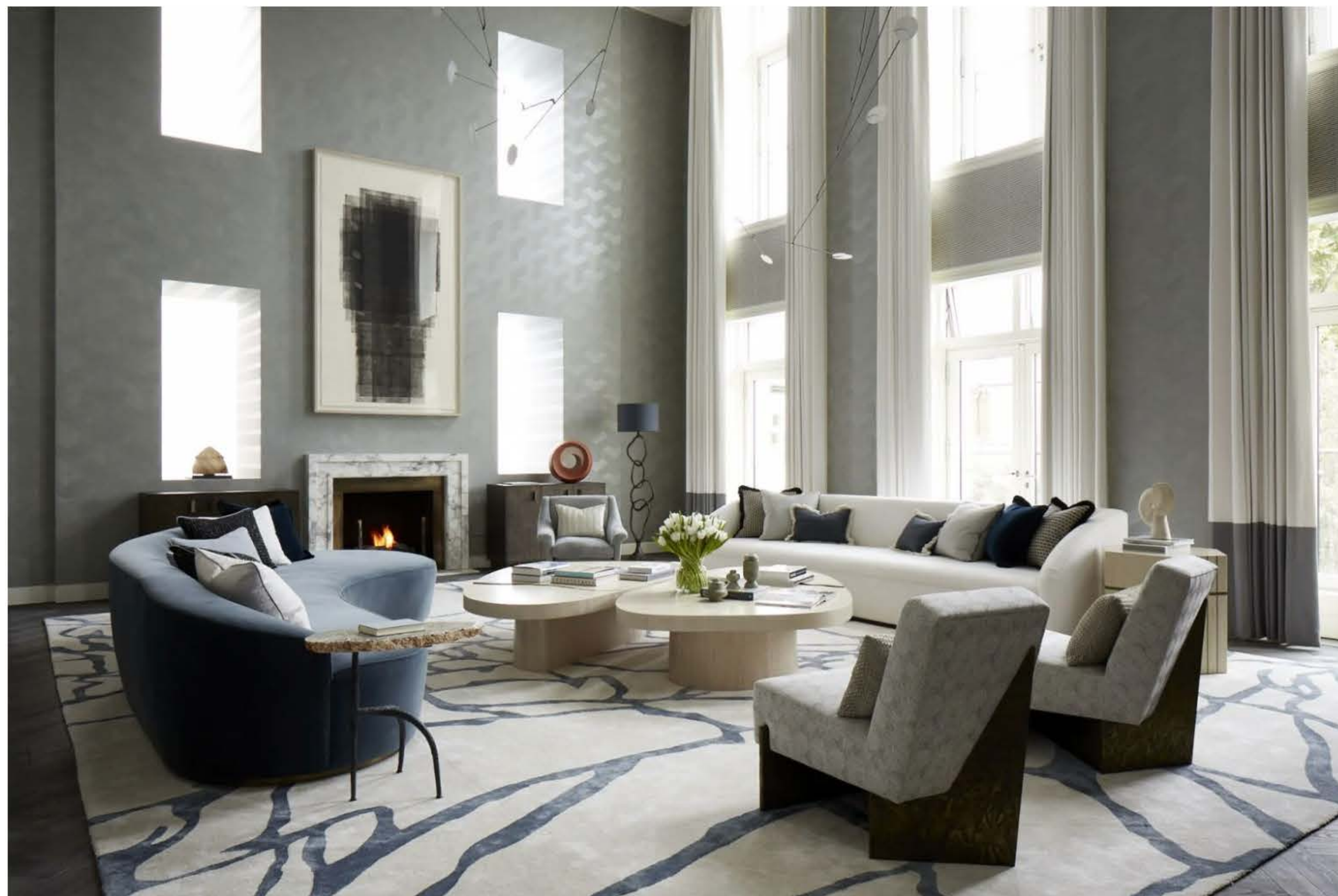
ABOVE Hand-painted walls resembling chevron marquetry in the double-height living room

“We aimed to be as inventive and creative as possible, and with a generous budget , we spent time hopping from gallery to gallery and visiting so many antique dealers and suppliers all over the world.”