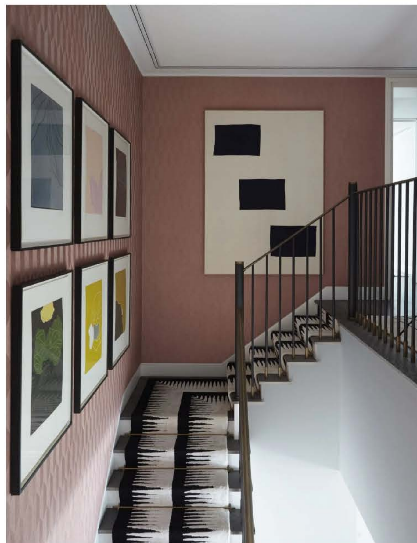
ABOVE The rich raspberry textured wall covering in the hallway