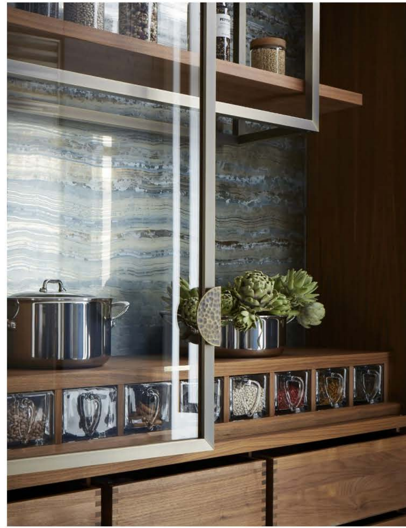
ABOVE Bespoke verre églomisé mirrored panels decorate the back of the pantry

In the double-height living room bathed in a soothing palette of dreamy blue, teal, and off-white are hand-painted walls by bespoke surface artisan Henry Van Der Vijver, whose minute detailing that resembles chevron marquetry took around 16 weeks to complete.