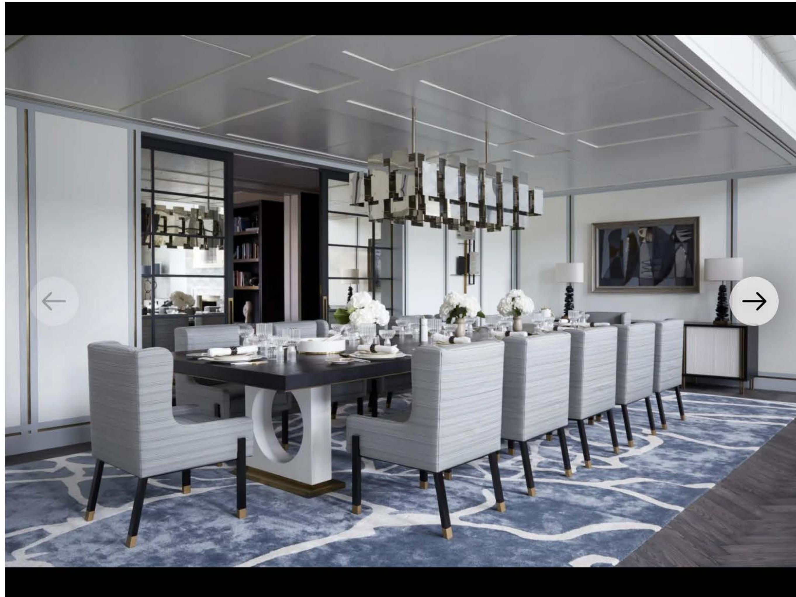
PHOTO 1 OF 2 A soothing palette of dreamy blue, teal, and off-white in the formal dining area

Read more: Nevermore Group's Marriott Penthouse is a master class in quiet luxury