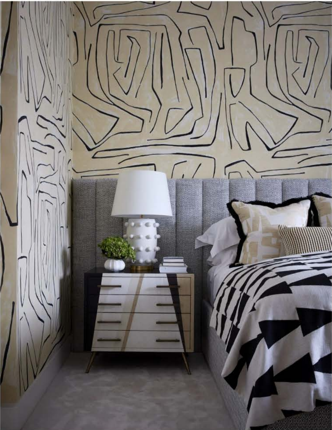
ABOVE The bedrooms are individual punches of personalities