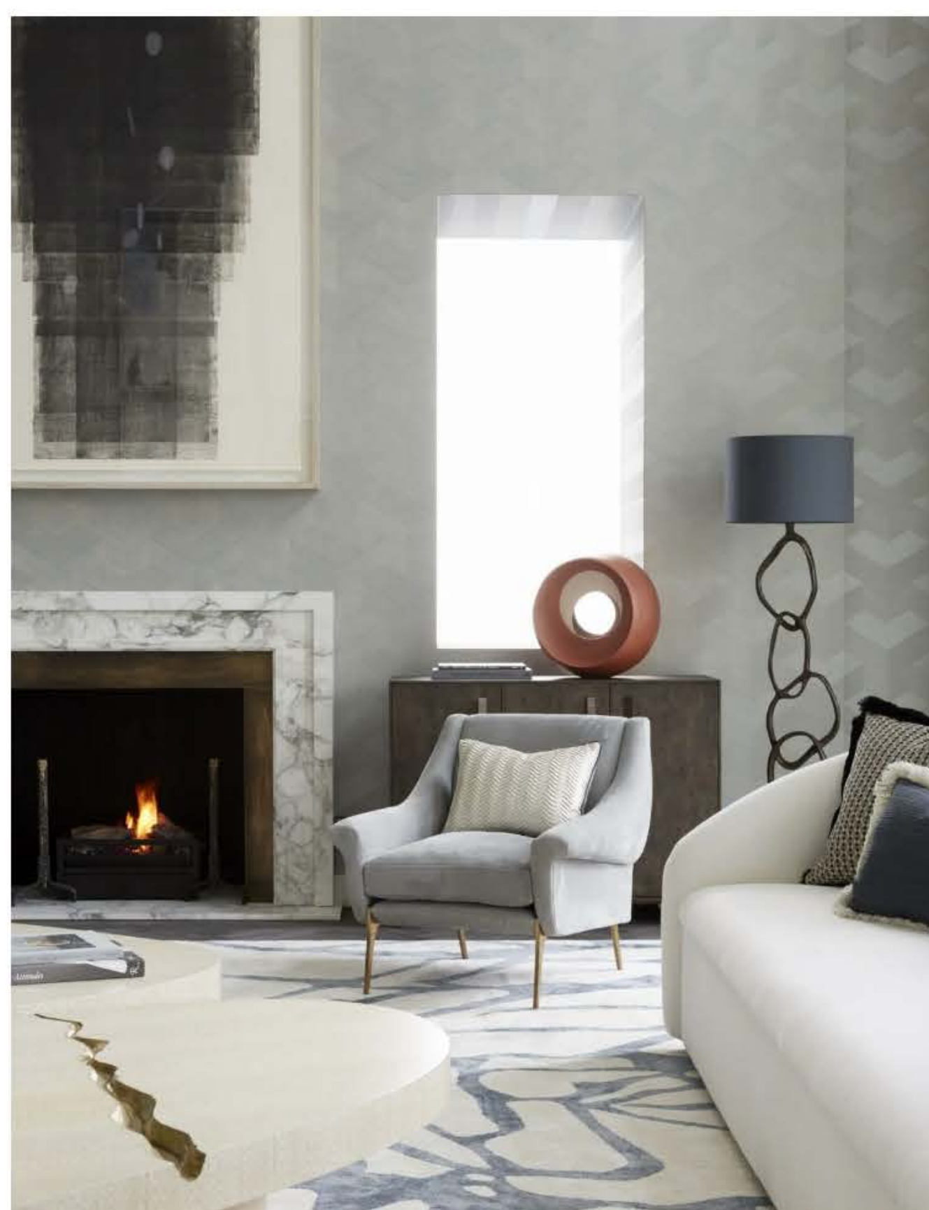
ABOVE An Antony Gormley art piece above the marble fireplace