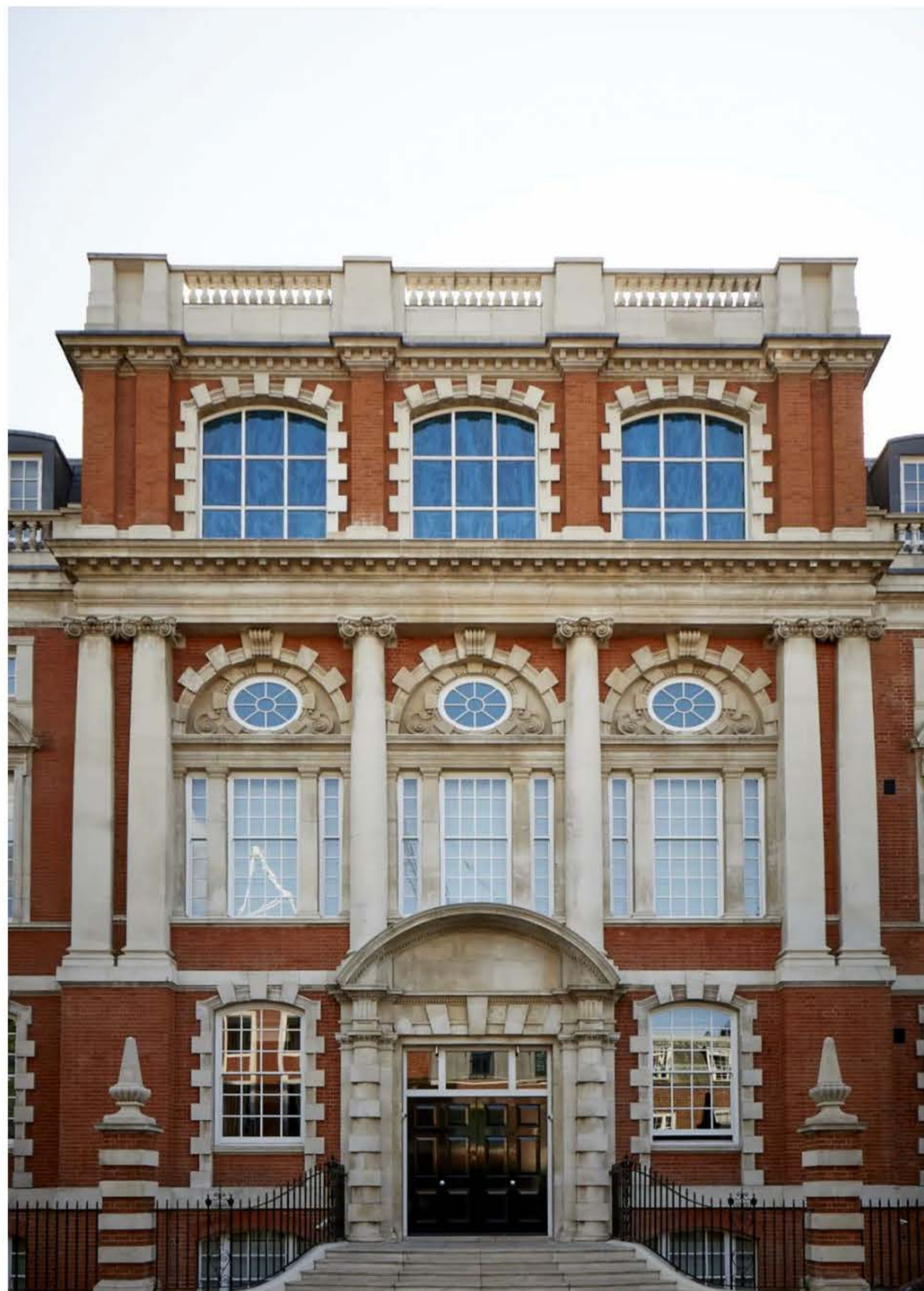
ABOVE The traditional brickwork façade of the old King's College dating back to the late 19th century

The homeowner, who is also a collector and philanthropist , appointed London-based interior design studio , Studio Vero, to carry out a full turnkey makeover, making sure to inject personality with an underlying universal appeal, without looking like a typical staged property.