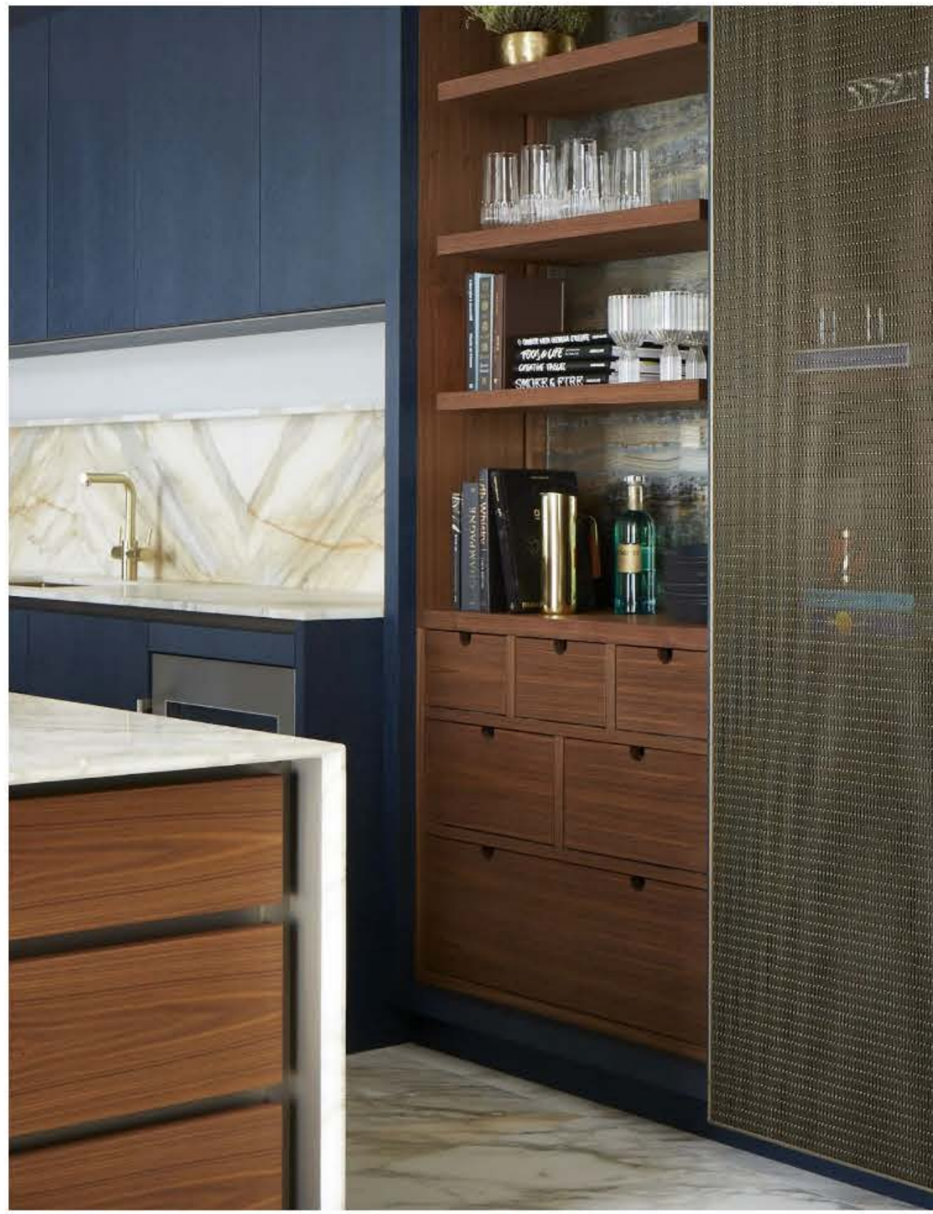
ABOVE Honed marble, dark blue veneered cabinetry and antiqued brass details