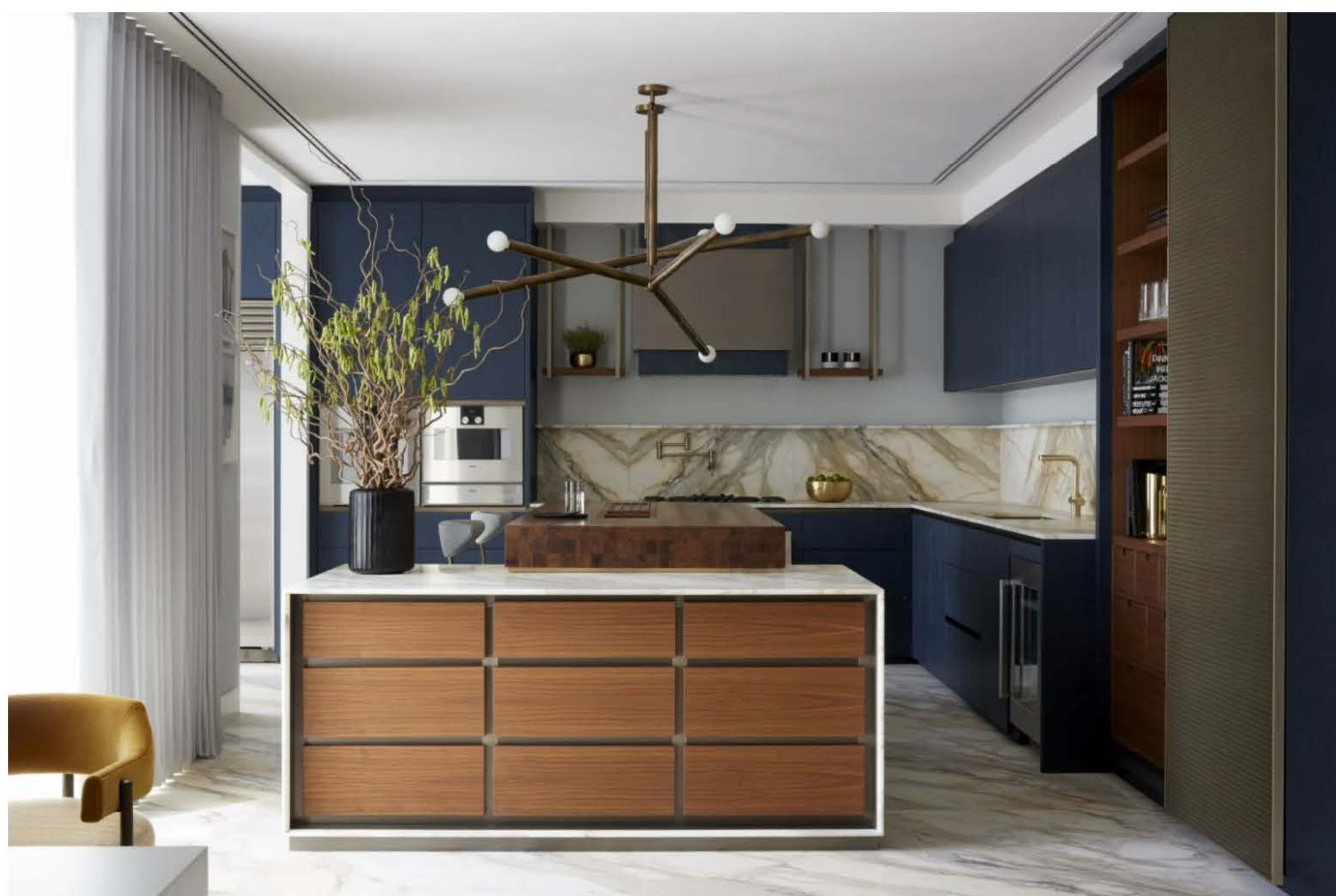
ABOVE The tastefully designed kitchen area

See also: Home tour: A colour coordinated holiday home in Martha's Vineyard, Massachusetts