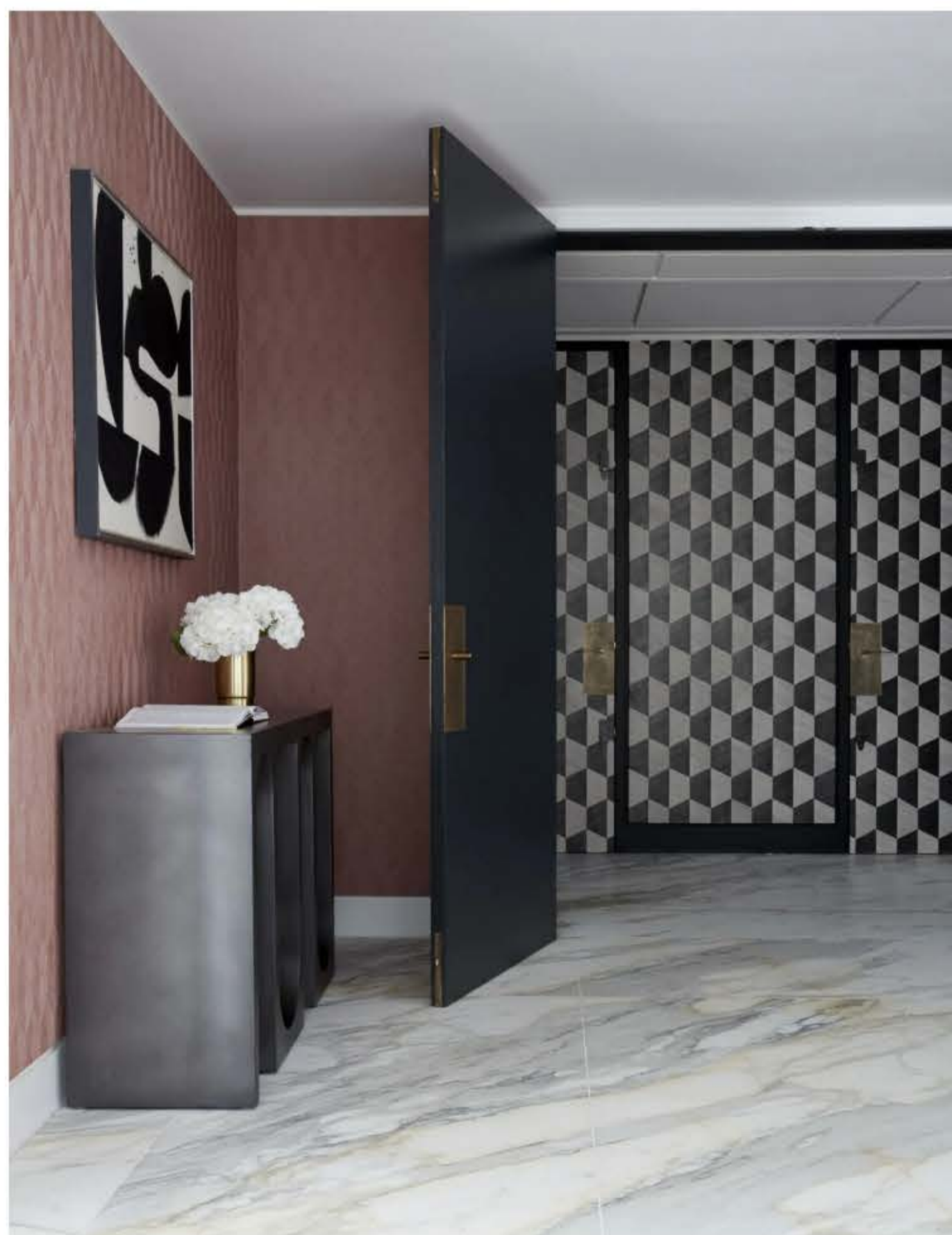
ABOVE The hand-painted monochrome chequered walls at the entrance

See also: Claudia Schiffer’s elegant tribute to the English countryside with Vista Alegre and Bordallo Pinheiro