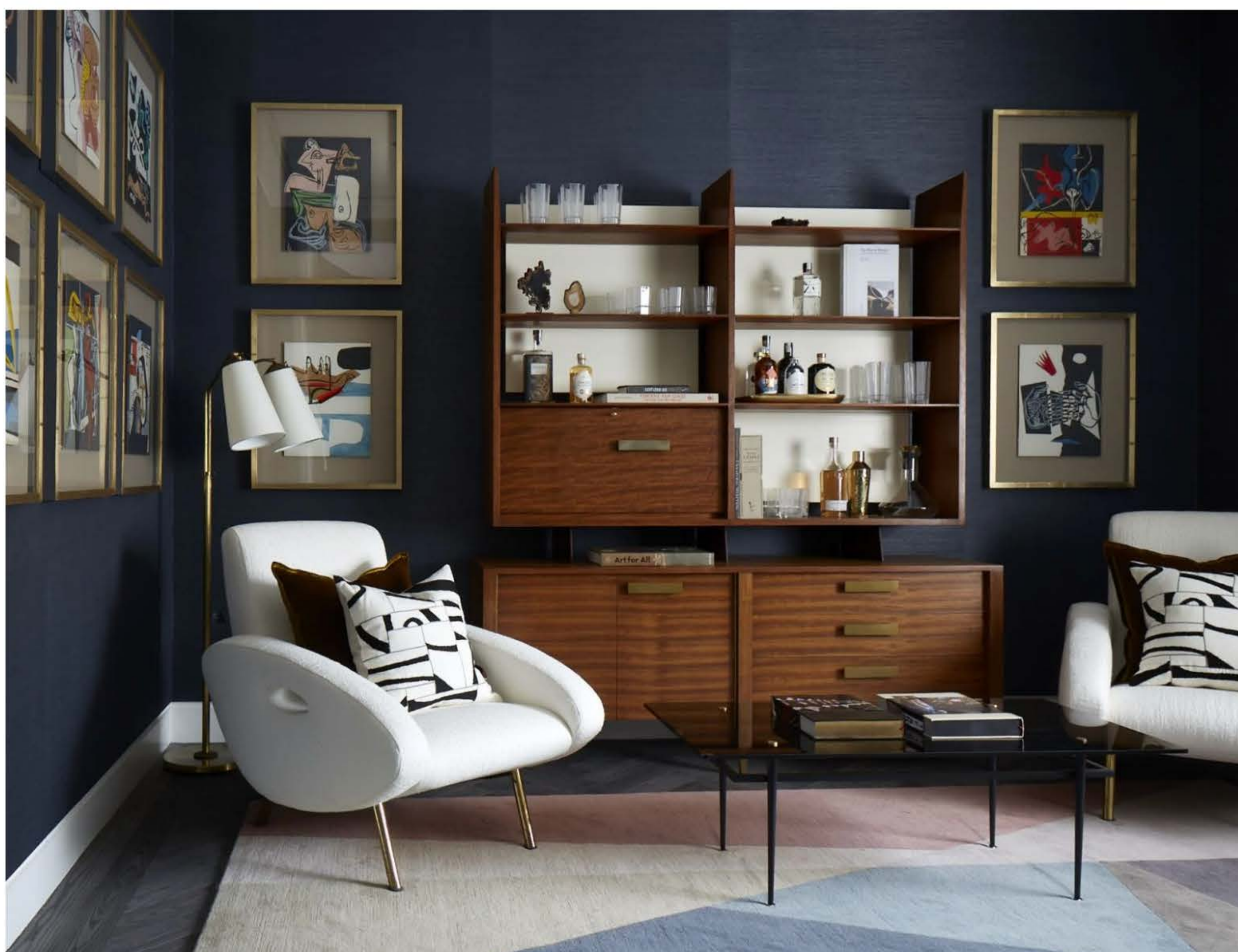
ABOVE Some of the art pieces purchased from 25 different galleries