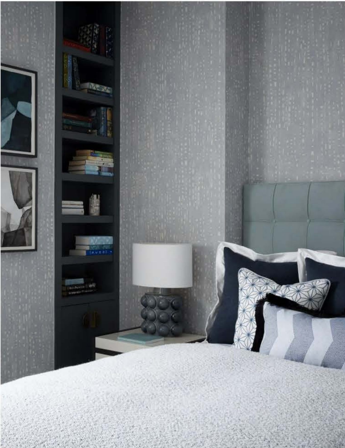
ABOVE Layered with vibrant patterns, colours, and textures

The bedrooms are individual punches of personalities, ranging from rich bronze to pink to duck egg blue , and each brimming with vibrant patterns , colours, and textures.