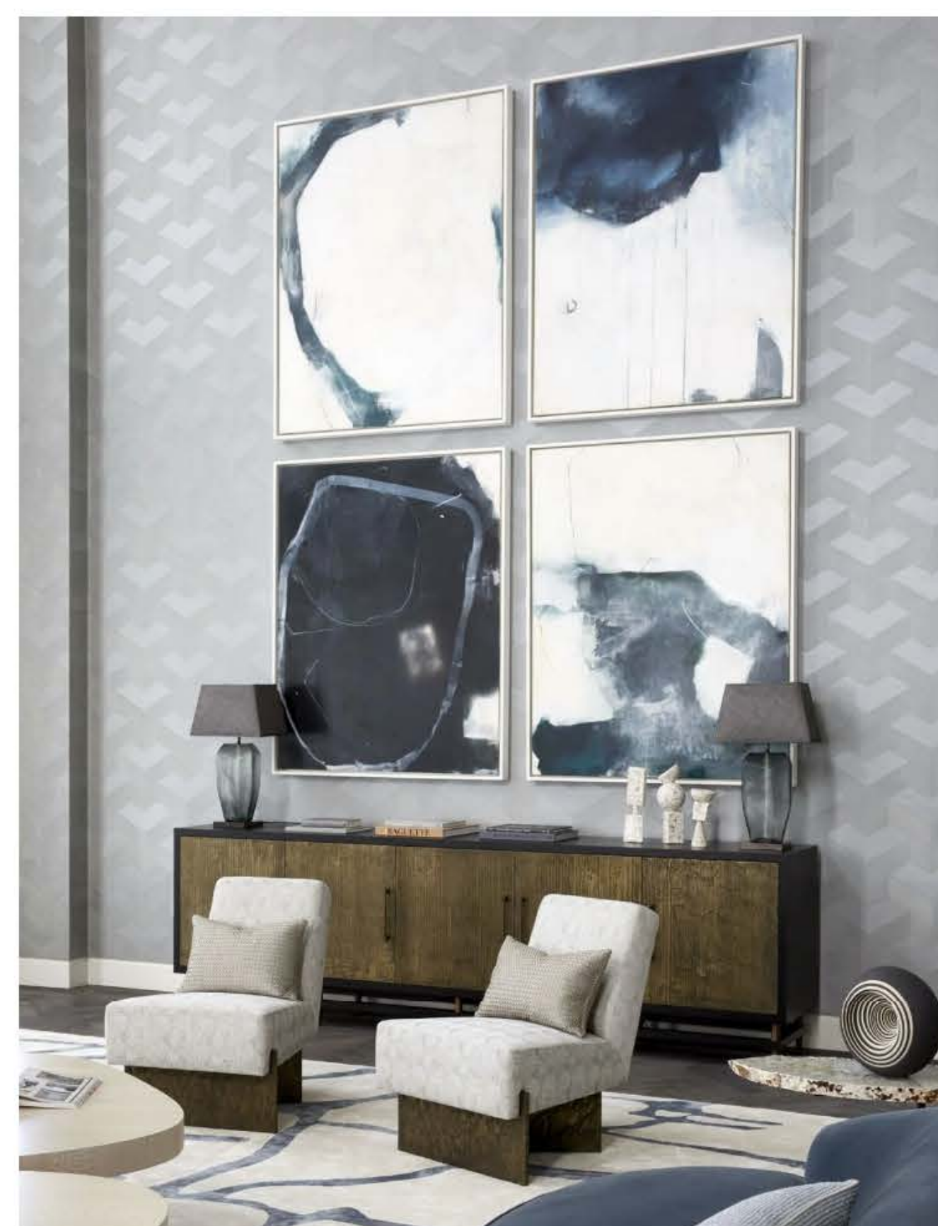
ABOVE An extensive layering of patterns, textures, and finishes

Likening the project to Lewis Carroll’s Alice in Wonderland , Studio Vero drew significant inspiration from interior design aesthetics in Paris and Los Angeles, and the design styles of Jean-Louis Deniot and Kelly Wearstler .